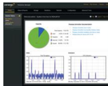
Panasas ActiveStor Manager GUI

Panasas ActiveStor Ultra is a single entity you manage from one graphical user interface (GUI) or command-line interface (CLI), no matter how many ActiveStor enclosures you integrate into it.